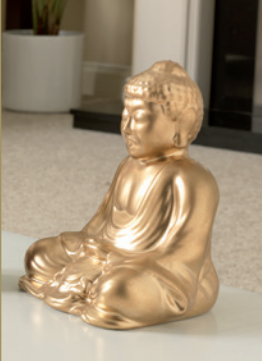
▲ Our Buddha was revived with two coats of Rust-Oleum Metallic Elegant Gold spray paint.