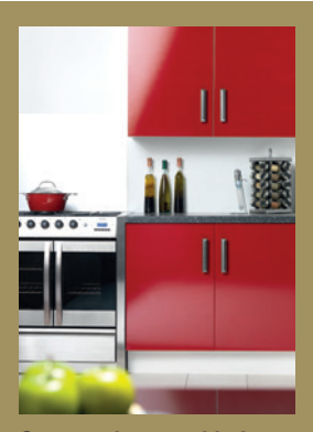
Spray paint your kitchen A fabulous new look for less.

CREATIVE PAINT IDEAS & INSPIRATION FOR YOUR HOME & GARDEN