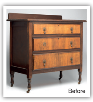
Visit www.rustoleumspraypaint.com for more information on the Chalky Finish Furniture Paint and how to use it!