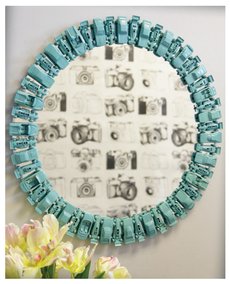
▲ Toy cars painted with Rust-Oleum Mode Primer and Rust-Oleum Mode in Pure Aqua.