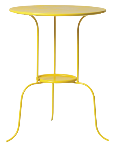
Cheryl gave this metal table a splash of bright colour with Rust-Oleum Mode Spray Paint in Sunflower.

www.allroundcreativejunkie.com @cheryl_lumley